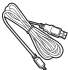
USB Charger Cable